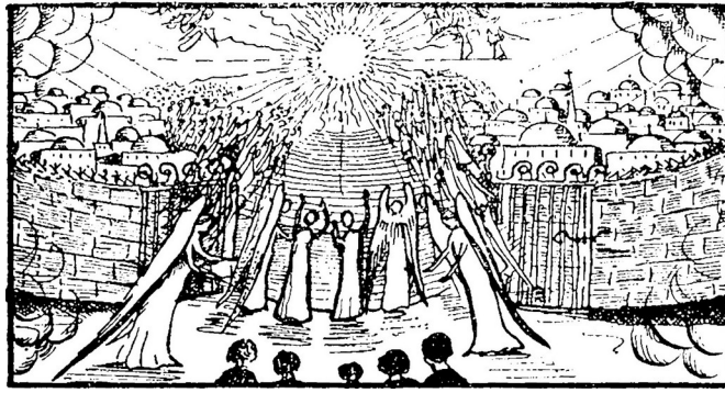
“Entering the Celestial City” – from “The Pilgrim’s Progress” by John Bunyan

The various major faiths of the world have different sorts of answers. Here is a brief summary.